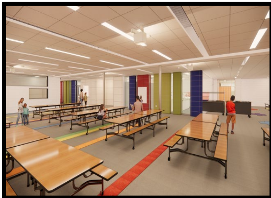
Artist Rendering of Bennet Student Commons Area