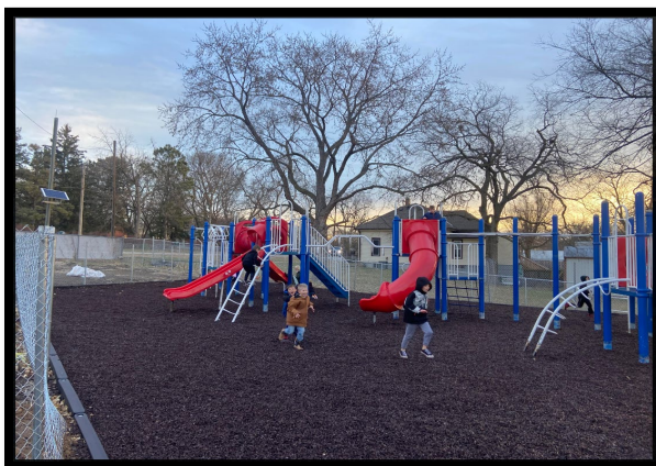
New location of Playground Equipment at Bennet