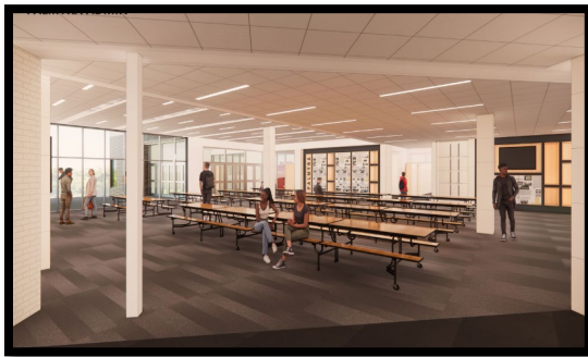
Rendering of Palmyra Student Commons Area