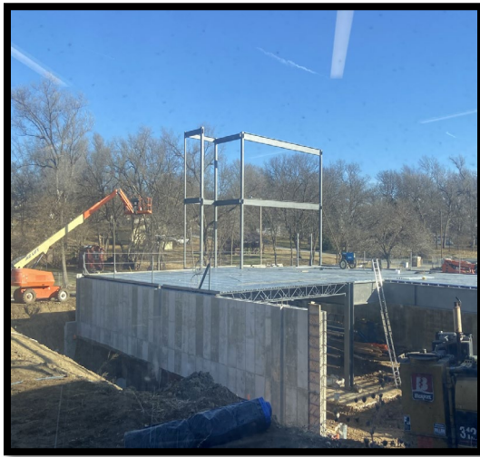
Palmyra looking northeast