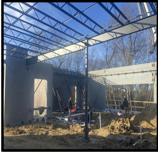
Bennet Elementary West side addition facing Southwest