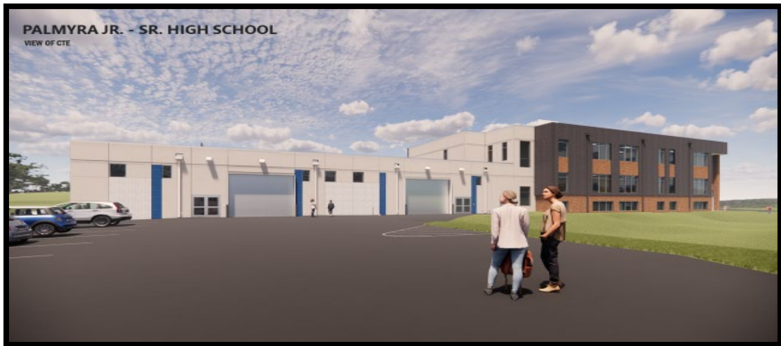
Rendering of Career Technical Education (CTE) Area (facing west)