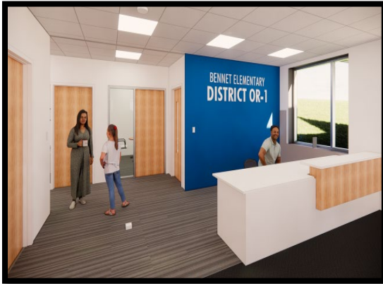
Artist rendering of the Bennet main office area