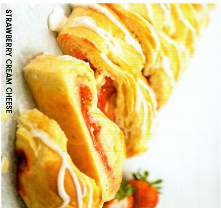
STRAWBERRY CREAM CHEESE