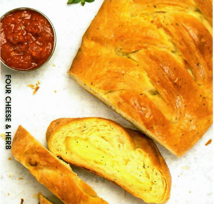
FOUR CHEESE & HERB

FUNDRAISING EXCLUSIVE • NOT SOLD IN STORES